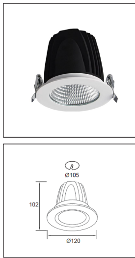
A - Ø 102-120mm